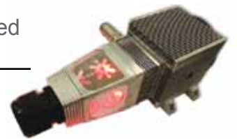
Ion Series LED Illuminators