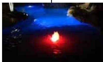
An Illuminator is needed to install this fixture.